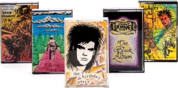
Scrapbooks made by Zoe Neale