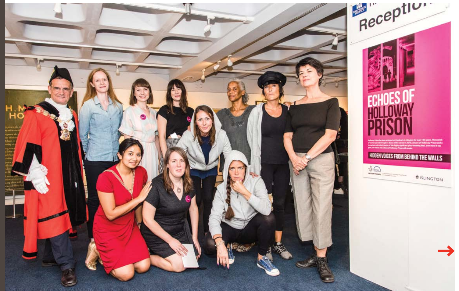
Launch of the Echoes of Holloway Prison exhibition