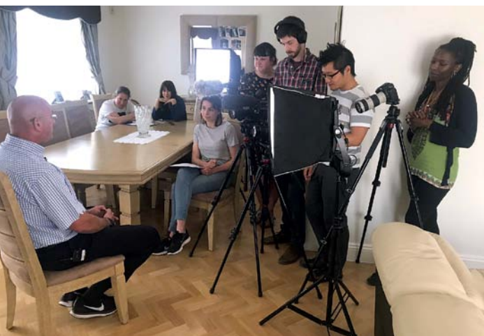
Filming on the Echoes of Holloway Prison project