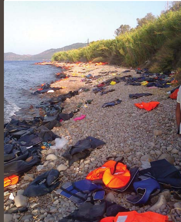
Abandoned lifejackets in Lesvos, Greece

In order to revitalise collecting at Manchester Museum the themes of water and migration were selected, both being very topical and of interest to visitors. They also supported the Museum's mission 'to build better understanding between cultures and to work towards a sustainable world'. Migration was an important factor during the referendum on the UK's membership of the European Union debate about Brexit, the election of Donald Trump in the United States, as well as more recent elections in Europe. The Museum felt it was important to collect an object that would symbolise these debates and enable the institution to stimulate discussion with its own visitors.