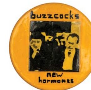
Handmade badges by David Smith