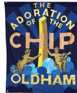
The Adoration of the Chip © Ed Hall

Commissioned by Museum Development North West (MDNW) through funding from Arts Council England, this toolkit was written by independent curator Jen Kavanagh in 2019. Contemporary collecting enables museums to improve inclusivity for, and tell more stories of, diverse audiences by adding material, oral histories and community stories to collections. New material can enhance collections and support the sector to open up debate around contemporary issues that affect people locally, regionally, nationally and globally.