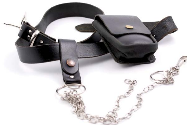
New Acquisition: Prison Officer's Belt