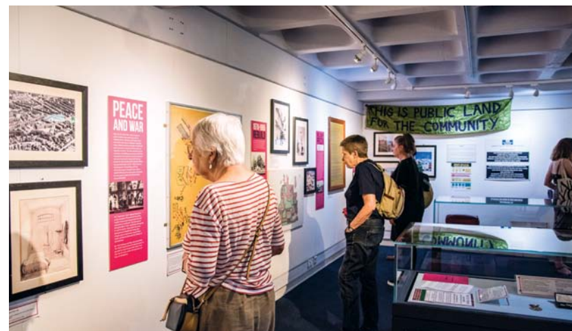
Temporary exhibition