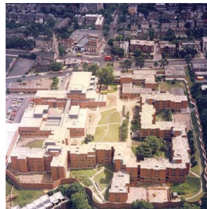
An aerial view of Holloway Prison in the 1980s

This project was intended to find 'hidden' stories and uncovering these was a key part of the approach to collecting. Individuals with specific knowledge relating to the prison or lived experience of Holloway were crucial to directing the project and ensuring the process of collecting fully reflected the diversity and complexity of the place and people.